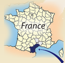
ROUSSILLON WINE REGION